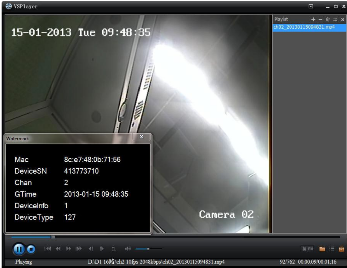
Figure 3, Watermark Information

Watermark Information: The watermark information will be displayed in a window, as shown in Figure 3, Watermark Information. If you modify the video (e.g., rotation, scaling, compression, etc.), the watermark information will change.