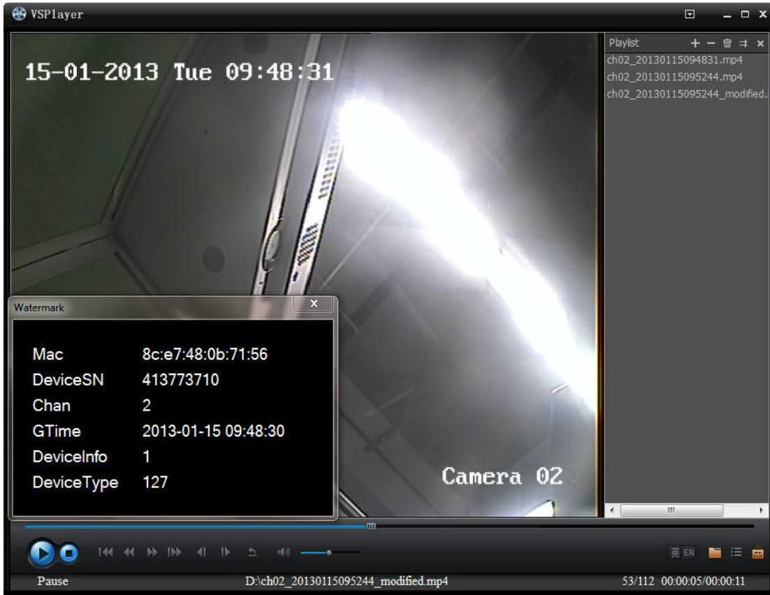
Figure 4, Modified Video File

Modified Video File: In Figure 4, Modified Video File , another video is merged with the original video file. Repeat Step 1 and Step 2, above, to see the new watermark information.