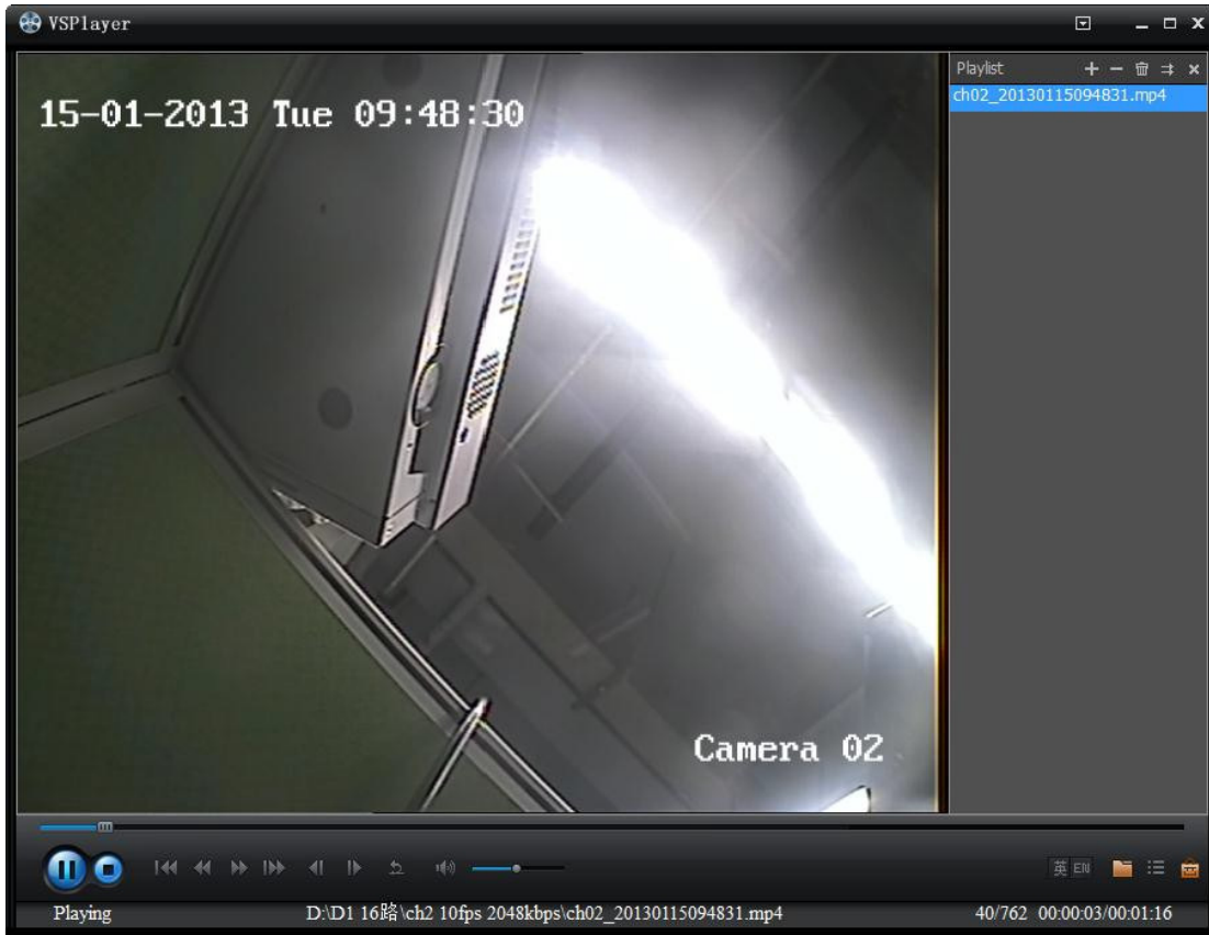
Figure 1, Downloaded Video File

Our watermark information is embedded in the I-frame of the video data. You can see the watermark information via our own VSPlayer.