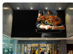
Retail Store & Cinema