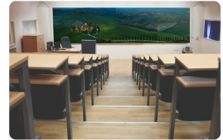
Auditorium & Lecture Hall