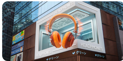
Outdoor Glasses-Free 3D